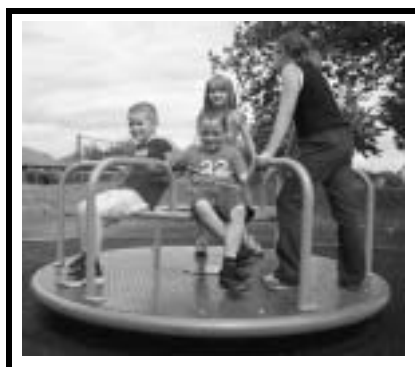
New equipment like this was considered during the consultations.

Work is expected to start in the very near future and we should certainly see the new equipment in use this summer, even if the target of it being complete by the start of the school holidays proves to be a little too ambitious!