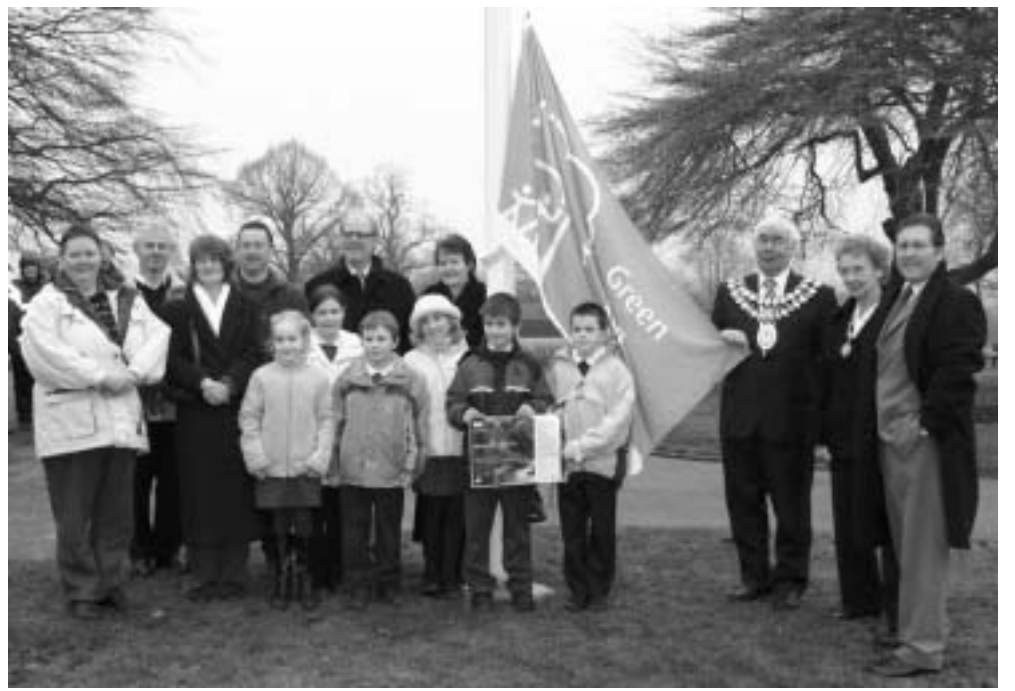
Green Flag hoisting ceremony in December 2004

The Friends of Marple Memorial Park were delighted to join The Mayor and Mayoress of Stockport, the Leader of Stockport Council and members of the SMBC Parks and Recreation Team to celebrate the Green Flag Award at a flag hoisting ceremony on 2nd December 2004.